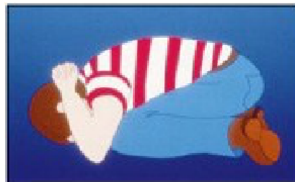
Head Tuck Position

This material is based on work supported by the Technology Based Child Care Training Grant funded by the Louisiana Department of Children and Family Services with American Recovery and Reinvestment Act Funds from the U.S. Department of Health and Human Services for Children and Families. Use of this material is governed by U.S. Copyright laws. 6/2012